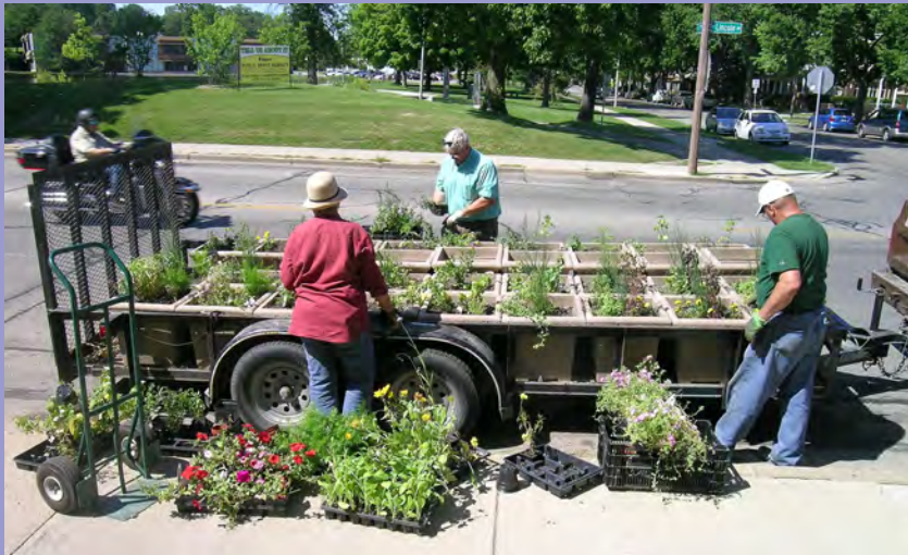
Staff of the University Extension Urban Agriculture program prepare planters for installation as part of the Kosciuszko Circle project

The Kosciuszko Circle includes the blocks of S. 6th, S. 7th, and S. 10th Streets between Lincoln Avenue and Becher Street, and Lincoln Avenue and Becher Street between 6th and 10th Streets.