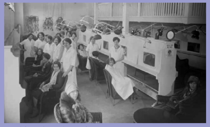
Going to the beauty parlor on Lincoln Avenue in the 1930s.