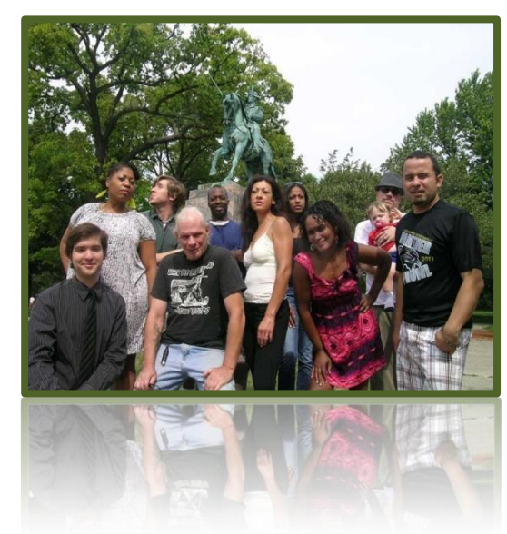
Cast of The March to Kosciuszko

This is the second play I've seen produced by you. Both times I learned stuff I never knew before. And both times I had to go to the Internet when I got home to try and learn more. Please do this again.