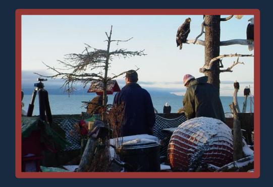
Parishioners caring for endangered eagles

The Congregation of the Great Spirit is a Catholic church that incorporates Native American traditions into the weekly mass. The church supports and maintains the Siggenauk Center which is in the old Rectory of the church property. The Siggenauk Center houses a food and clothing bank which is open every Thursday at 1:00 to 3:00 pm, and every Friday 10:00 am to noon. The clothing bank is open during these hours too.