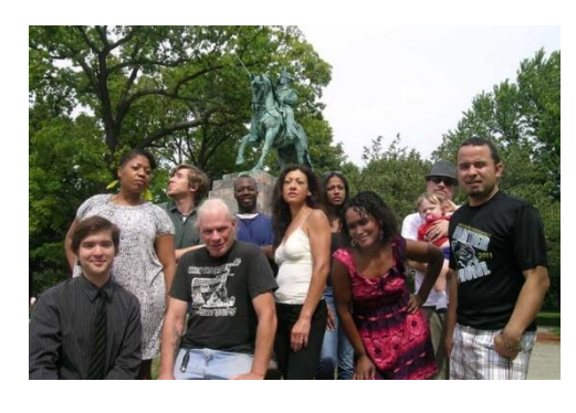
Play cast in front of General Kosciuszko Monument

A play in November will focus on 1967 march to Kosciuszko Park