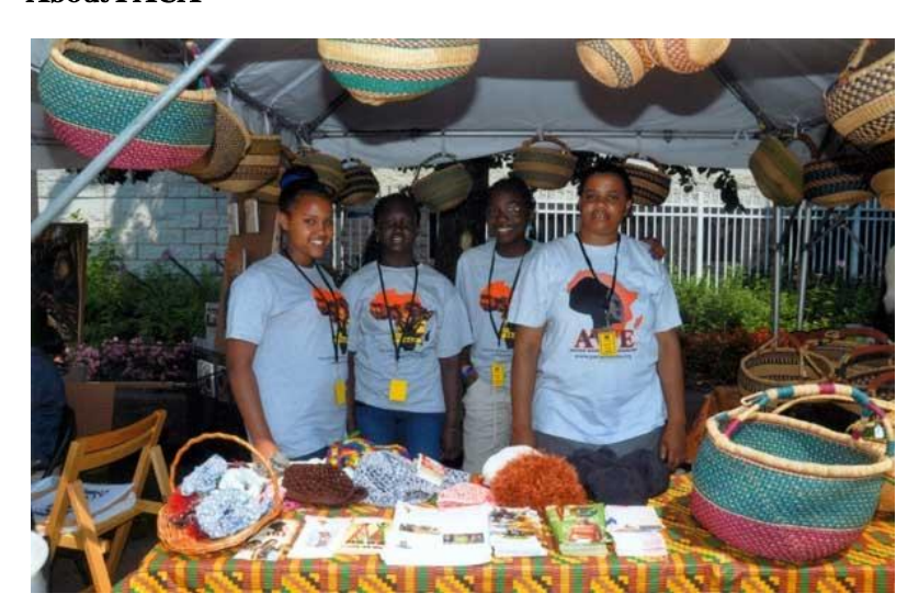
Above are members of the Coalition of African Youth and African Women Entrepreneurship

PACA brings together all people of African descent to preserve and enrich African cultural values through education, empowerment, and dialogue, serving the needs of the greater Milwaukee community.